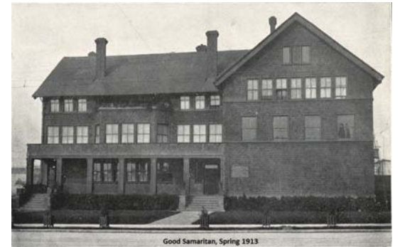
Good Samaritan Settlement House