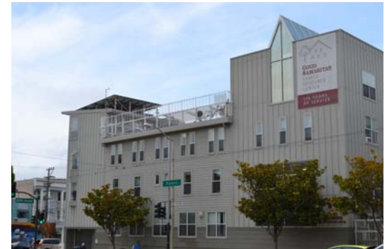
Good Samaritan Family Resource Center