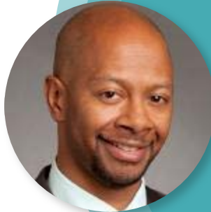
Quincy Wilkins Center for States